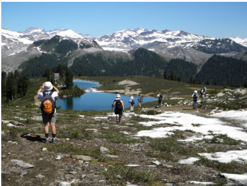
Elfin Lakes

For trips to South Vancouver, Richmond, Delta and the Islands , car pool at Oak & 42nd in Vancouver. Take bus #17 Oak from downtown and get off at Oak and 41st. Or bus #41 between Dunbar and Joyce Station, get off at Oak St. and walk to 42nd.