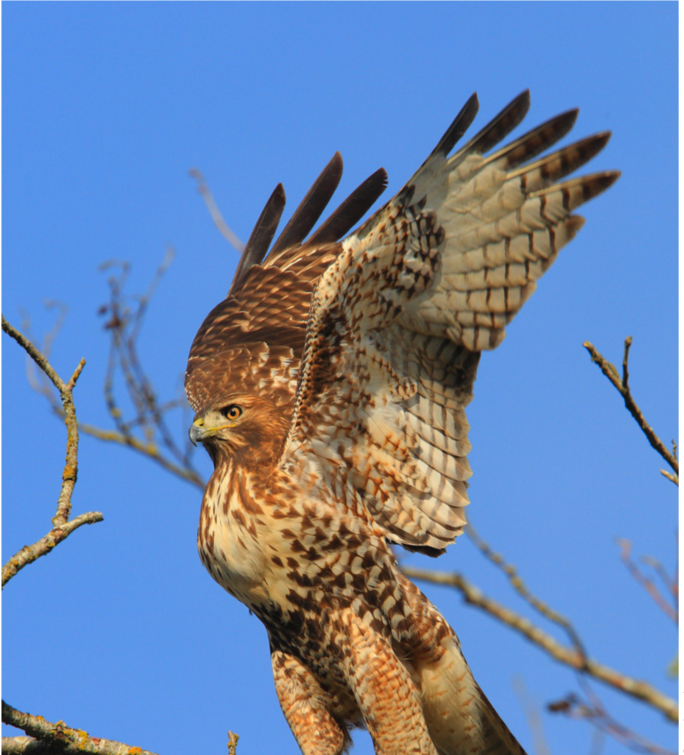
Red-tailed Hawk